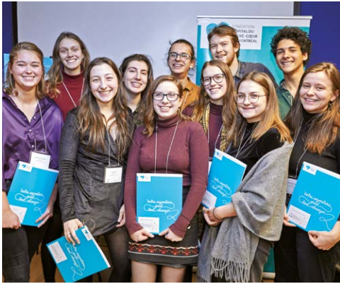
The scholarship recipients.

Since July 2018, thanks to the initiative of the L'Écuyer family and their important donation, patients at the Albert-Prévost Mental Health Hospital have been able to attend , music concerts provided in the simplest of settings each Wednesday and Sunday, on two floors dedicated to patient care.