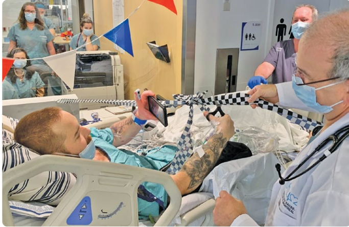
June 14 Arrival of the first patient in the new Intensive Care Unit.

On June 14, after four and a half years of construction work, the first patient was transferred to the new Intensive Care Unit, located in the Integrated Trauma Centre of the Montreal Sacré-Cœur Hospital. The intensive care teams, the Mother-Child Unit, as well as the Endoscopy Department, took turns joining the research and teaching teams, which already moved to their new premises in the fall of 2021.