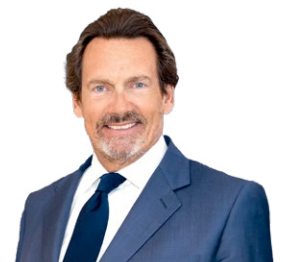
Pierre Karl Péladeau Ambassador of the Circle of Big Hearts

Pierre Karl Péladeau, Ambassador of the Circle of Big Hearts, has once again committed to double the total amount of all new pledges by the end of 2022, up to $25,000. "It is with great pleasure that I have agreed for a second year to be associated with the Circle of Big Hearts initiative. To thank you for your commitment as a monthly donor, I wanted to make, like you, another gesture of giving for Sacré-Cœur," said Mr. Péladeau.