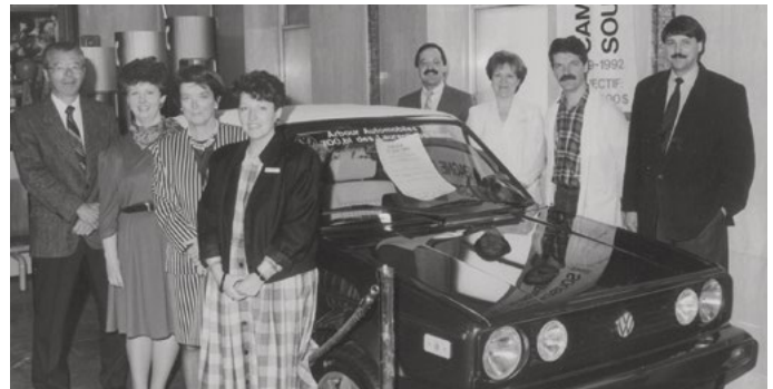
The first major fundraising campaign.